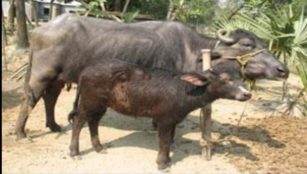
Fig. 2. First AI buffalo calf born in Bangladesh